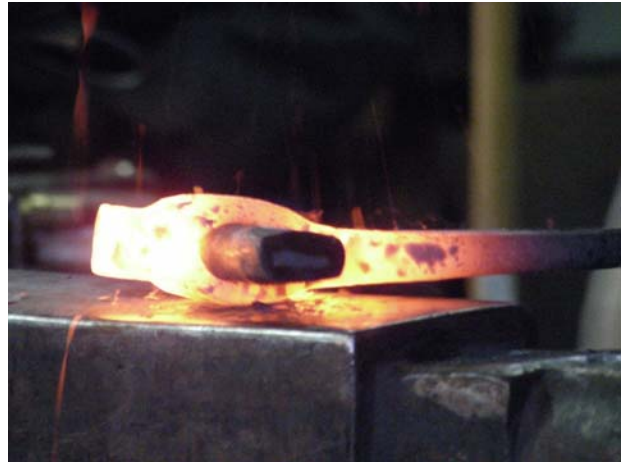
No text, pictures continued