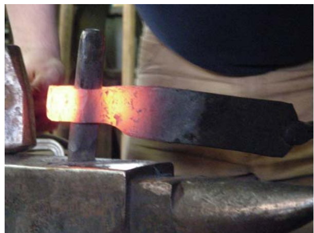
on next page!