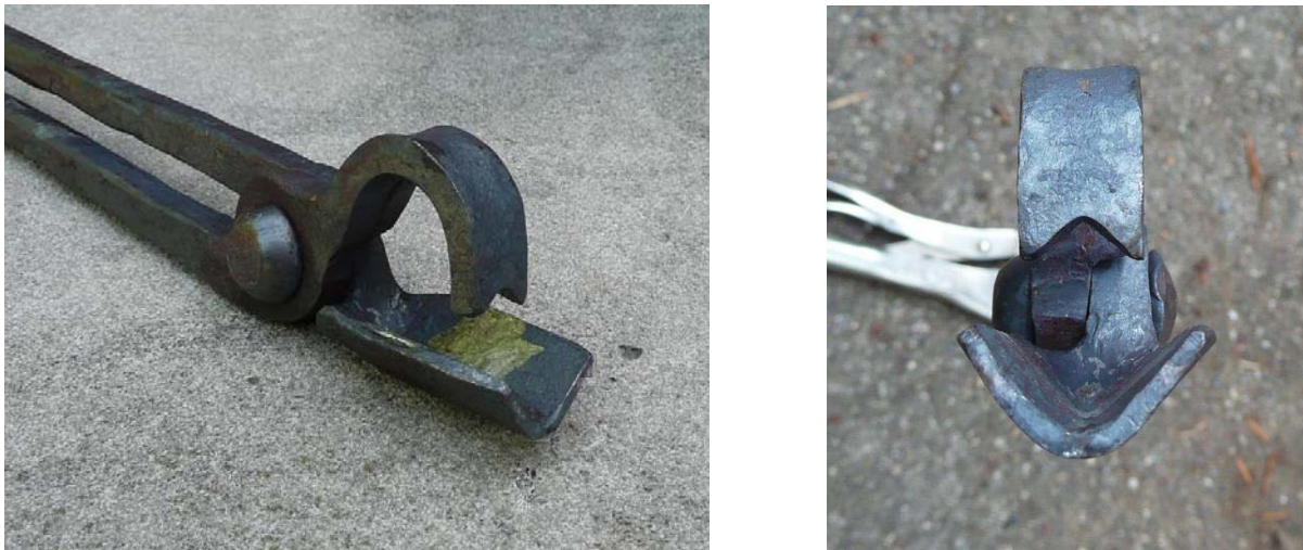
Figure 1: Three-quarter view and front view.

I made the tongs in figure 1 based on an article in the German metalworking magazine Hephastos ( http://www.metall-aktiv.de/ ). The tongs were developed by Patrick Pelgrom, a Belgian blacksmith who travels a lot by airplane. In order to reduce the weight of his luggage, he developed a pair of tongs that would be able to securely hold square, round and flat stock. This way, he was able to reduce the number of tongs he carries with him. His tongs were inspired by how one would hold a piece of (cold) metal with three fingers. The V angled bottom takes on the functionality of the index and middle fingers and the rounded top that of the thumb. Notice the notch in the rounded top which is designed to give good grip. While they are in essence v-bit tongs, they excel at holding flat and irregularly shaped stock.