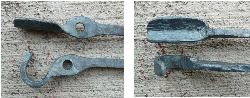
Figure 3: Forged business ends.

To make the rounded top, draw the business end to 1/2" wide, by 3/16" thick by about 2 1/4" long. Figure 3 shows the result of forging the top and bottom. Notice that the top is actually too long.