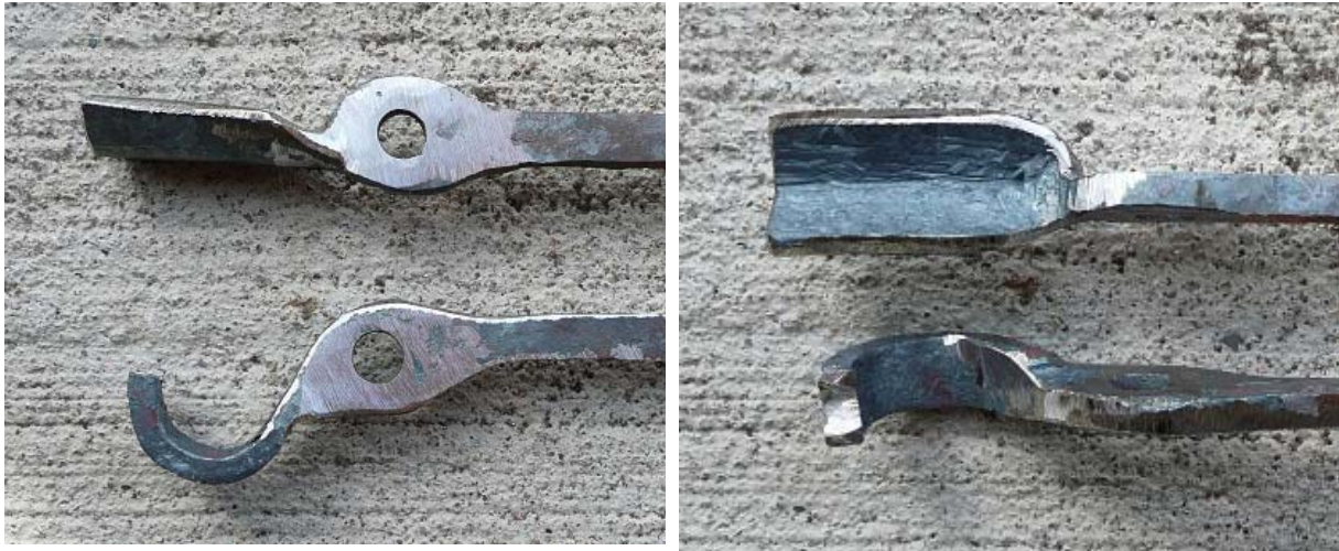
Figure 4: After clean-up.

When putting together the tongs, I like to insert a thin piece of cardboard between the pieces, such as from a cereal box. This prevents over tightening of the tongs when setting the rivet. I just burn off the cardboard piece when finished and tighten the tongs if necessary. Figure 5 shows the medium sized tongs holding the small sized ones.