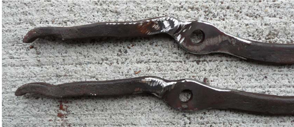
Figure 2: Tongs separated, sharp edges removed and trimmed for weight.

To make the rounded top, draw the business end to 1/2" wide, by 3/16" thick by about 2 1/4" long. Figure 3 shows the result of forging the top and bottom. Notice that the top is actually too long.