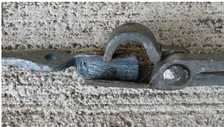
Figure 5: Big brother holding little brother.

When putting together the tongs, I like to insert a thin piece of cardboard between the pieces, such as from a cereal box. This prevents over tightening of the tongs when setting the rivet. I just burn off the cardboard piece when finished and tighten the tongs if necessary. Figure 5 shows the medium sized tongs holding the small sized ones.