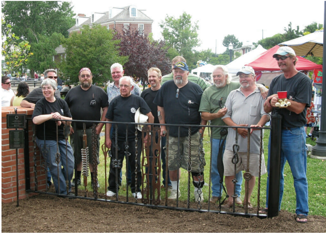
Some of the crew that made the pickets for the fence at the dedication